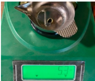
SMALL BRASS “HORSESHOE” STYLE WEIGHT V. ADJUSTABLE NOCKING POINT

Enter the adjustable nocking point - brilliant! Oh, and check it out; 5 times less weight! Even with one placed above and below (so the shaft can’t walk the string) you’re still half the weight as one brass nock point. We all know what that means - lighter weight on string - string recovers quicker - arrow is faster! As a matter of fact your perfectly tuned shaft may now need a slight adjustment to again be perfect. So, what is the down side? You HAVE to be able to tie knots! Didn’t get that Boy Scout Badge? Not to worry! Here are the steps (picture by picture), you can do it! If you’re like me you might say: “ I learn better when someone shows me ”. Okay, we have you covered too, as long as you have the internet. Check out YouTube TTT Archery - Adjustable Tie Nocks (the right way) .